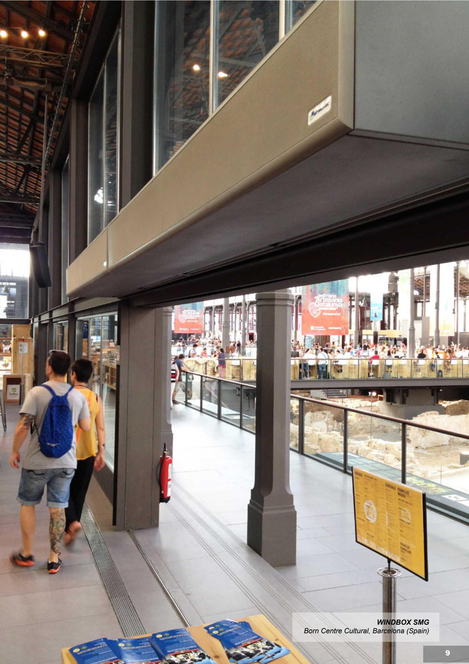
WINDBOX SMG Born Centre Cultural, Barcelona (Spain)