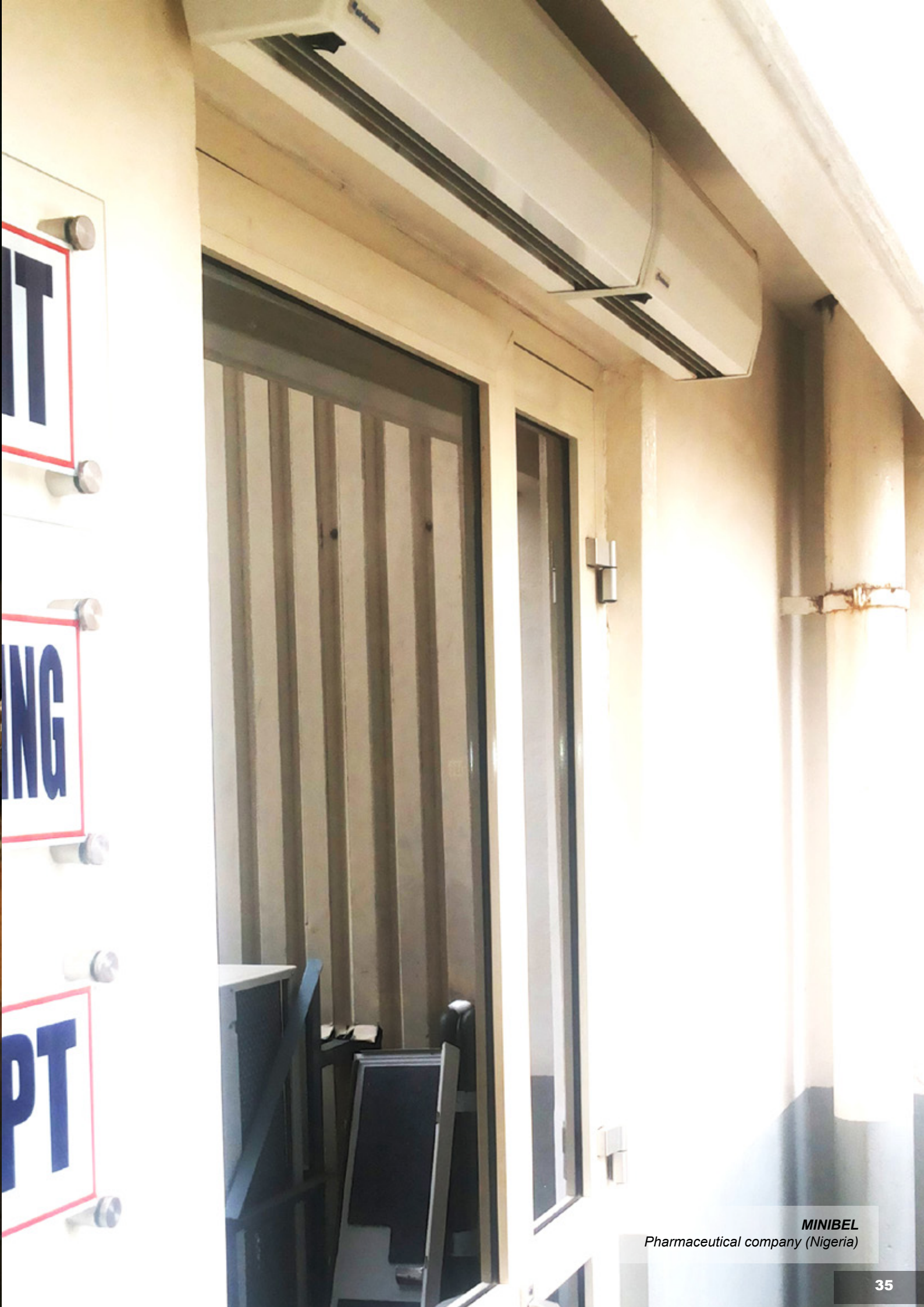
MINIBEL Pharmaceutical company (Nigeria)