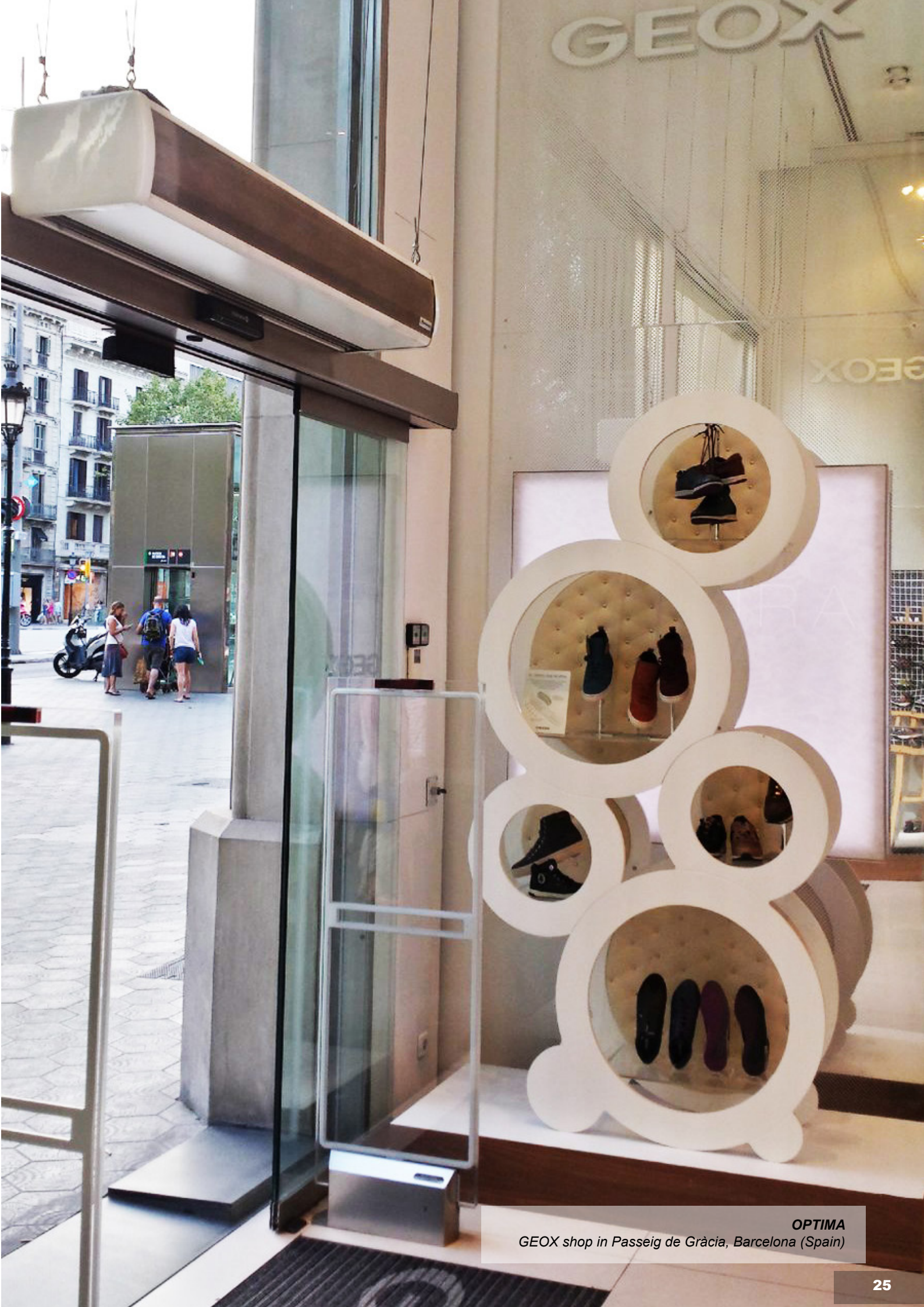
OPTIMA GEOX shop in Passeig de Gràcia, Barcelona (Spain)