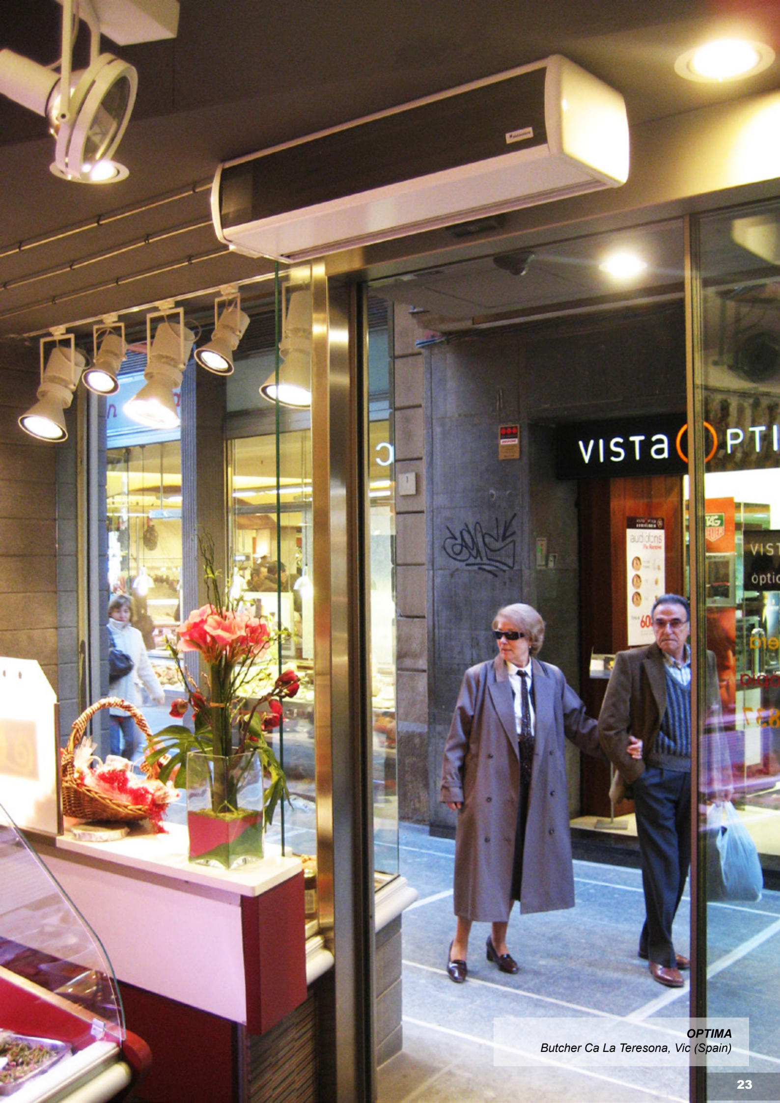
OPTIMA Butcher Ca La Teresona, Vic (Spain)