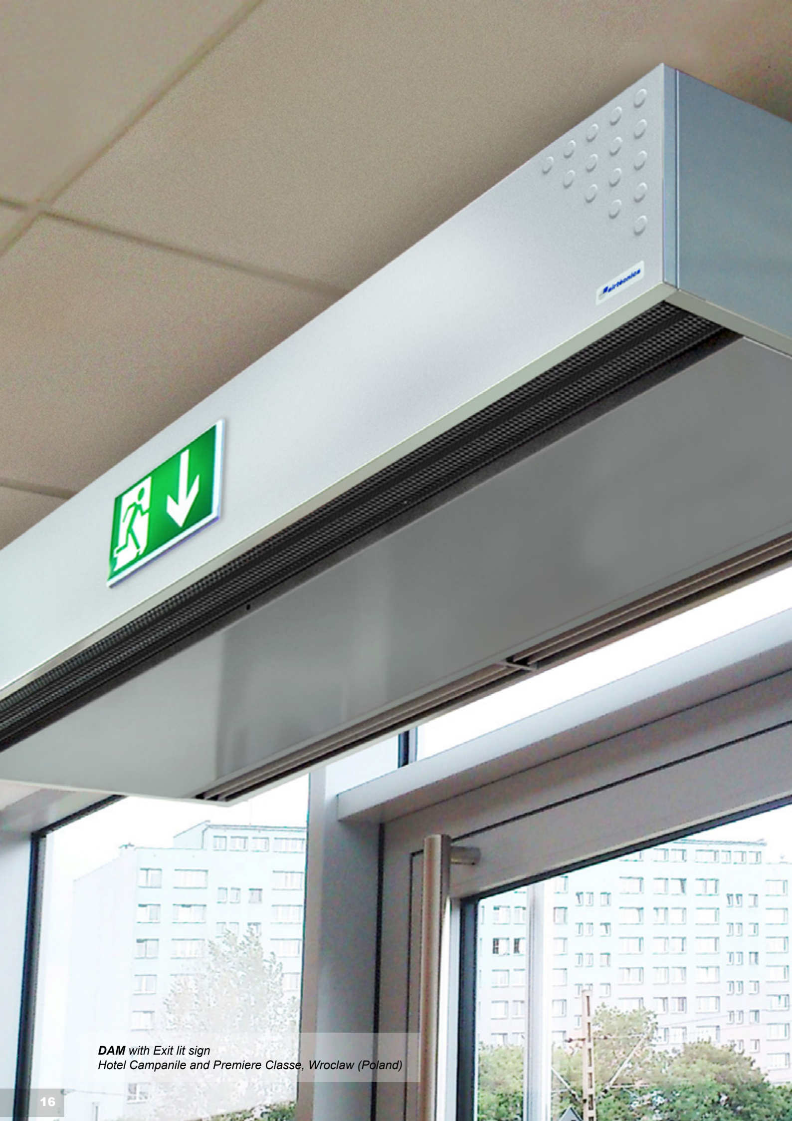
DAM with Exit lit sign Hotel Campanile and Premiere Classe, Wroclaw (Poland)