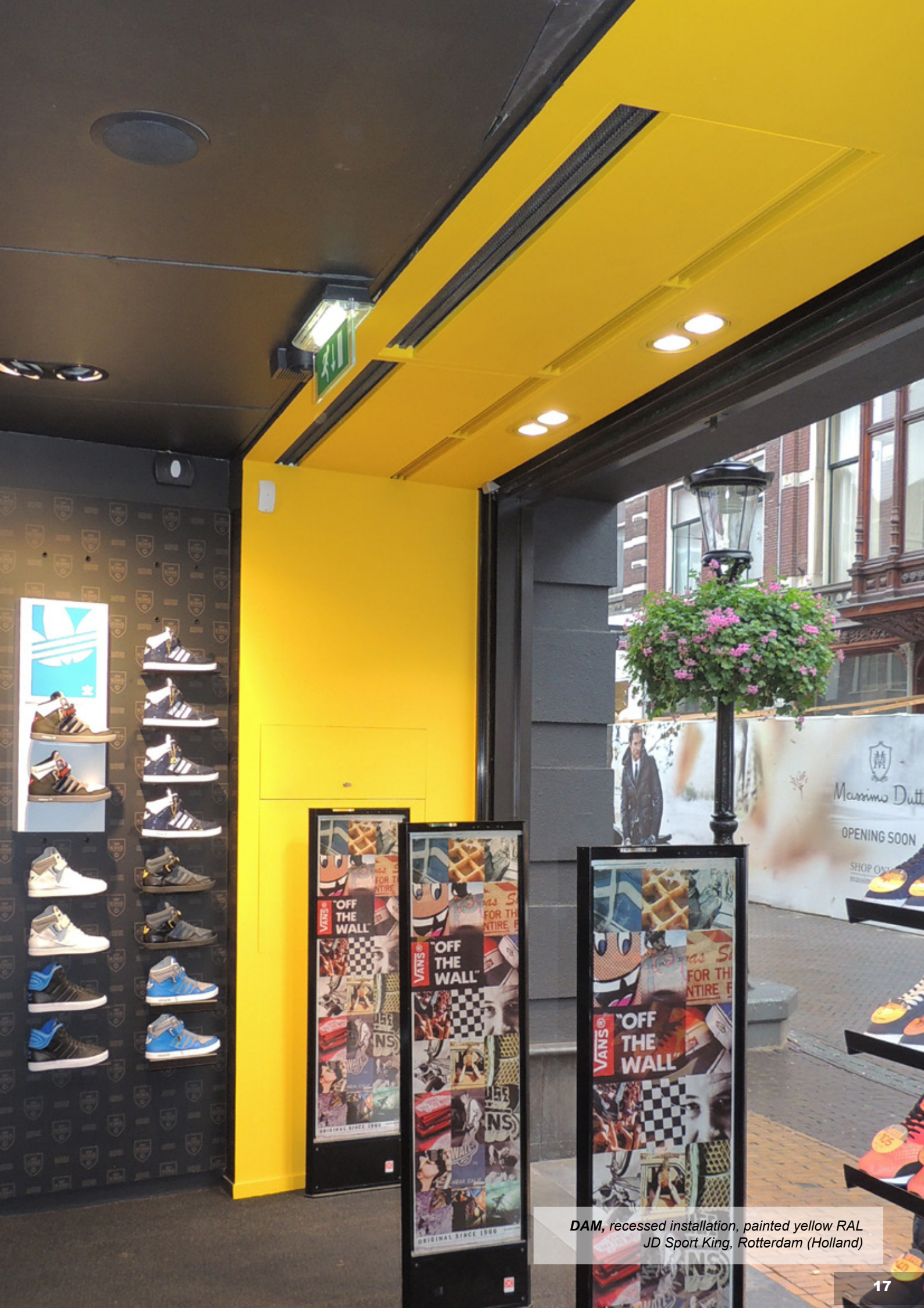
DAM, recessed installation, painted yellow RAL JD Sport King, Rotterdam (Holland)