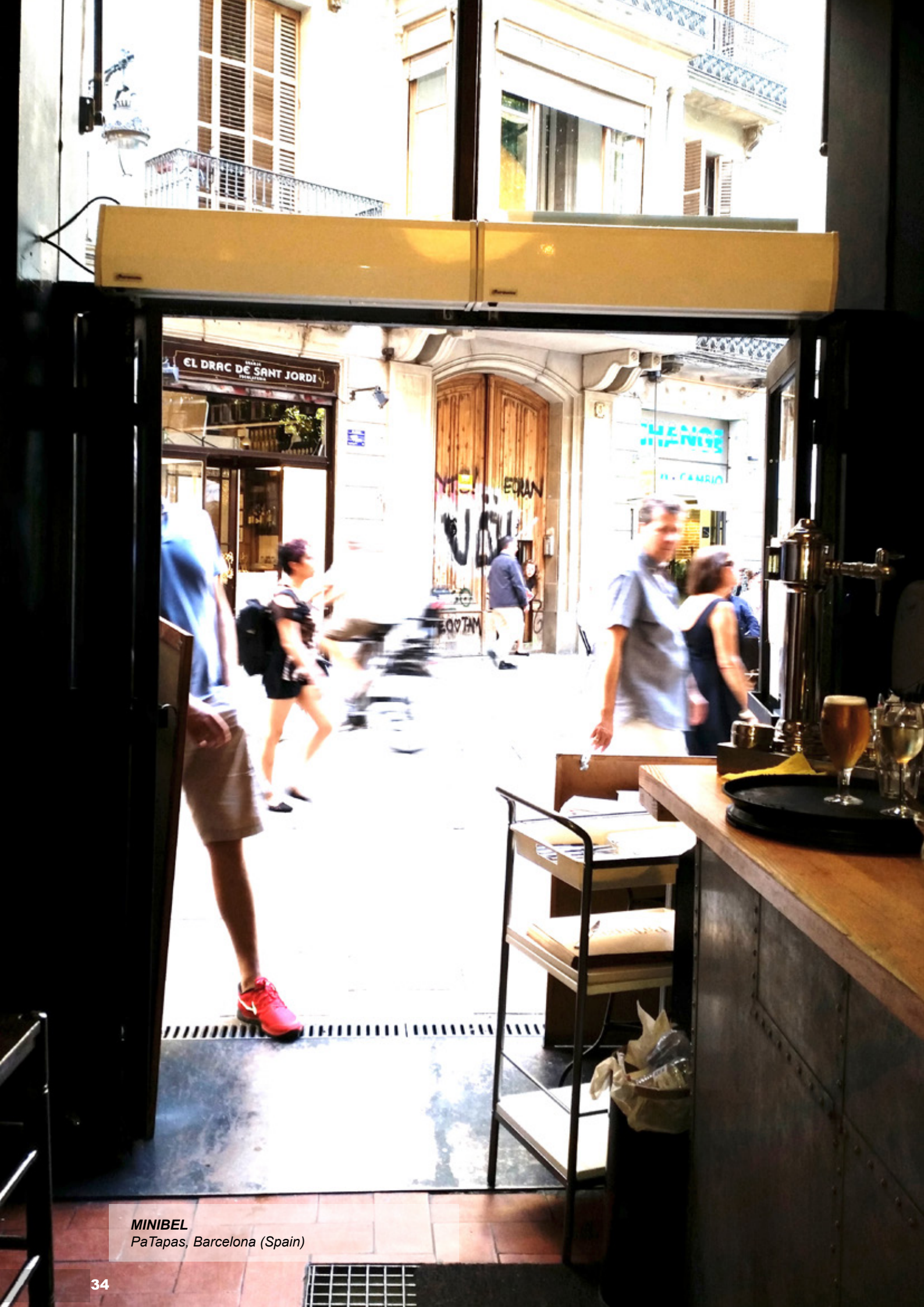
MINIBEL PaTapas, Barcelona (Spain)