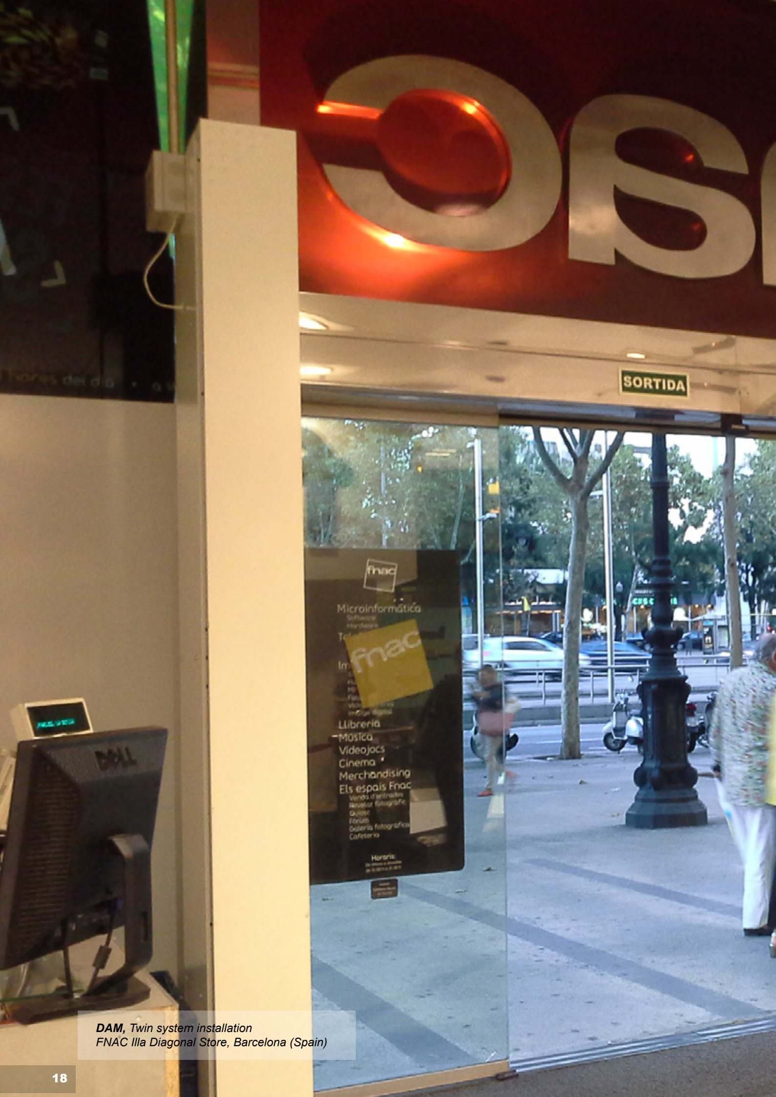
DAM, Twin system installation FNAC Illa Diagonal Store, Barcelona (Spain)