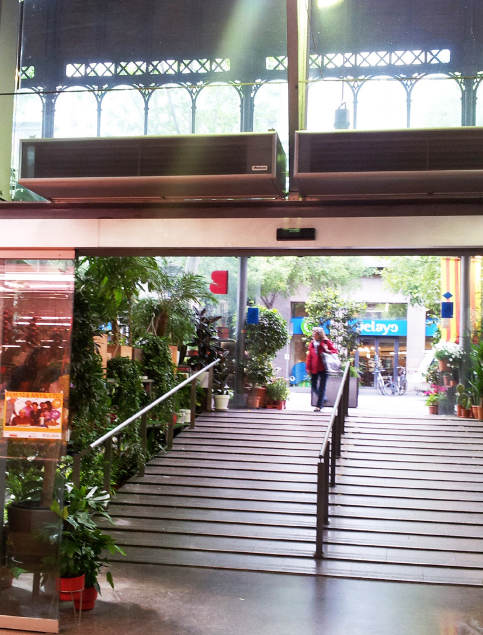
WINDBOX SMG, multiple installation Mercat de la Concepció, Barcelona (Spain)