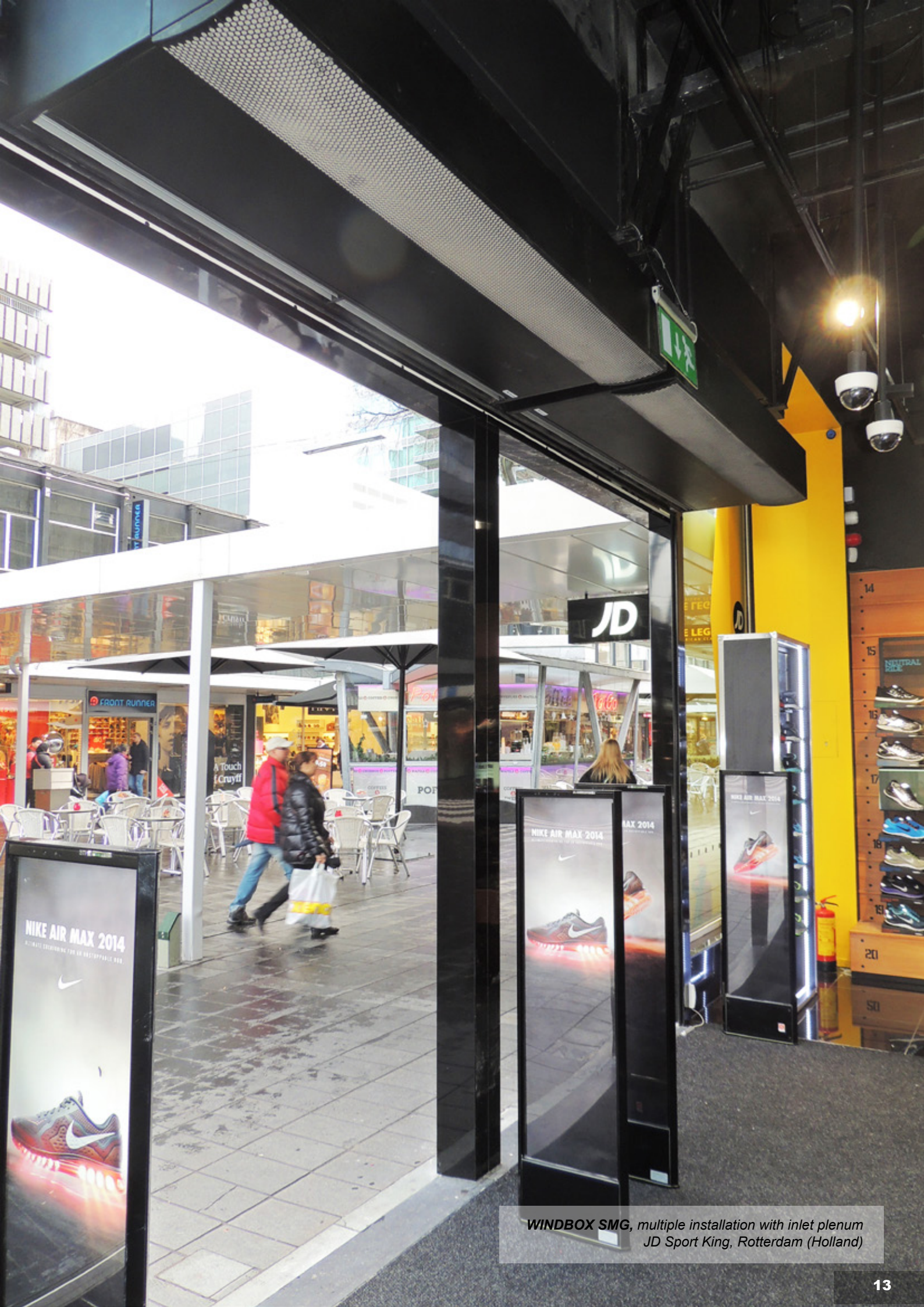
WINDBOX SMG , multiple installation with inlet plenum JD Sport King, Rotterdam (Holland)