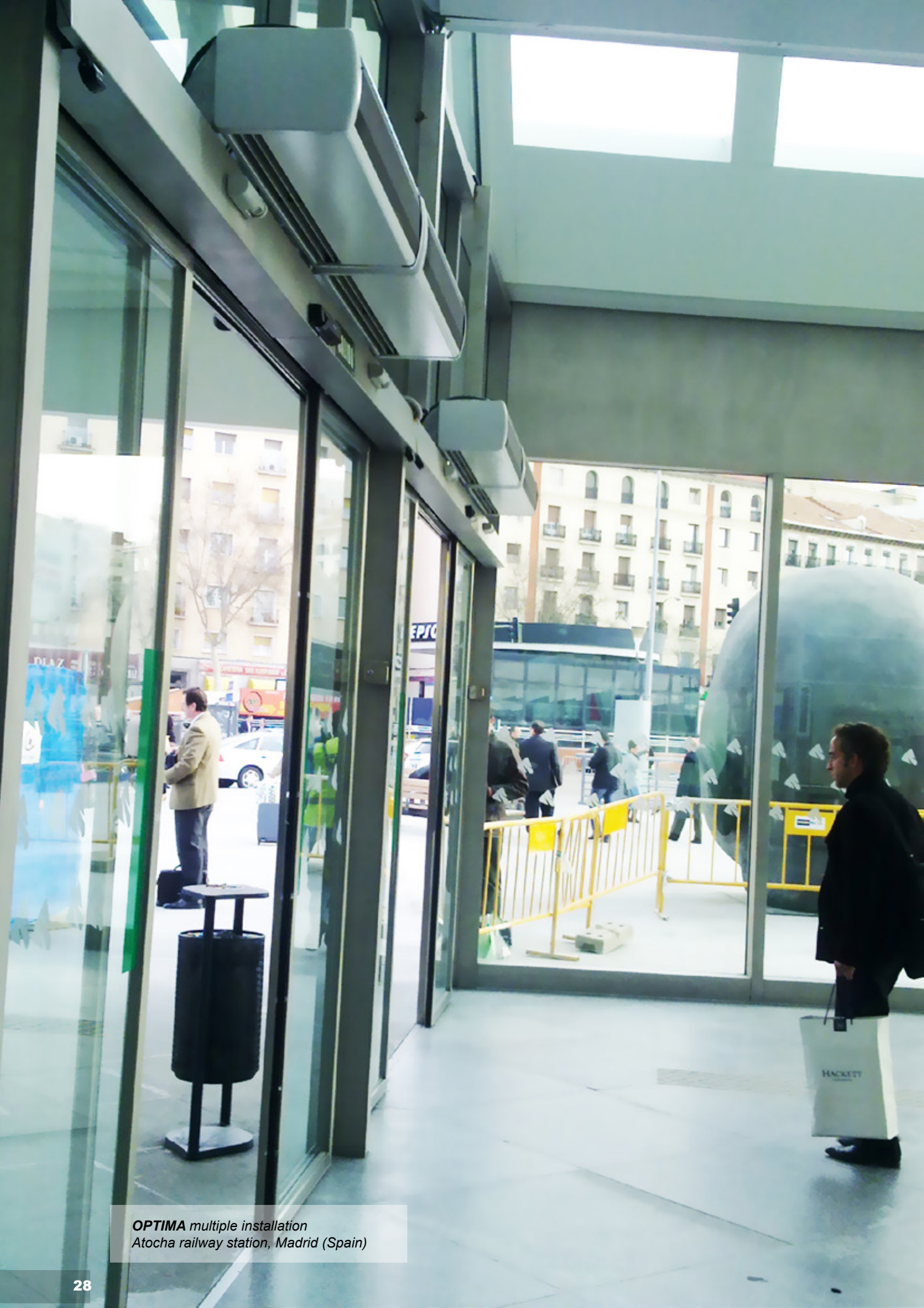
OPTIMA multiple installation Atocha railway station, Madrid (Spain)