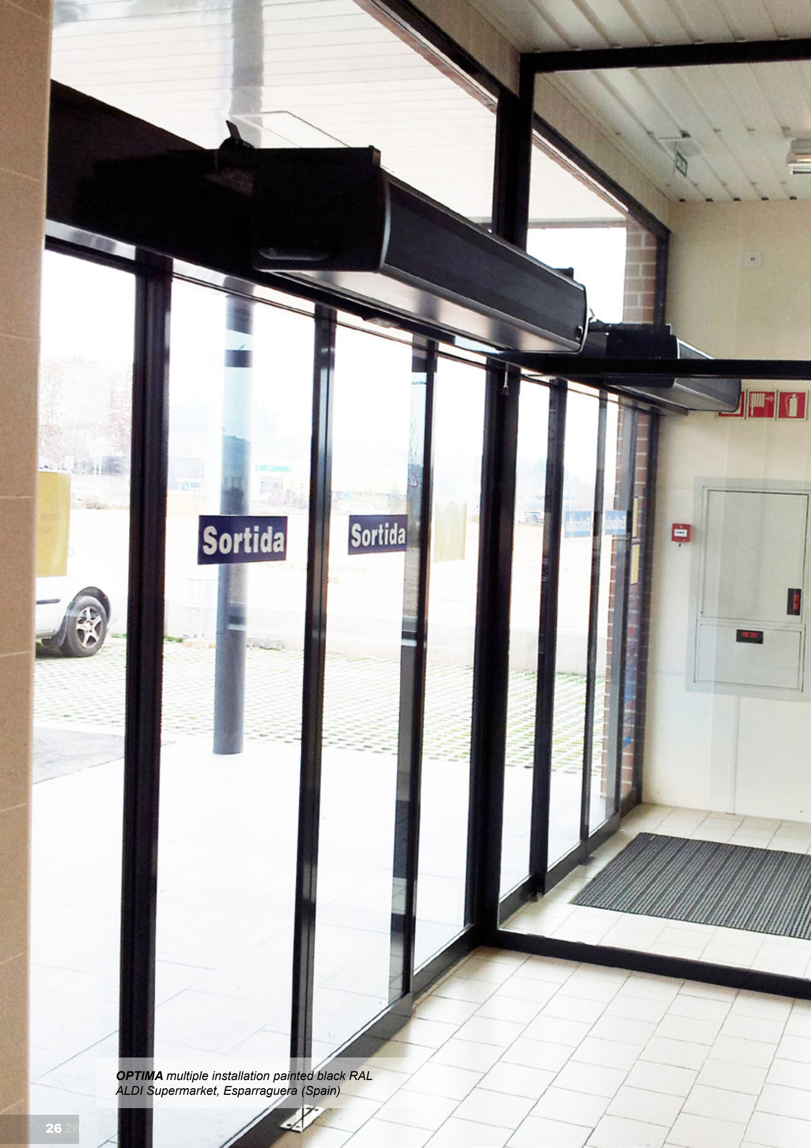
OPTIMA multiple installation painted black RAL ALDI Supermarket, Esparraguera (Spain)