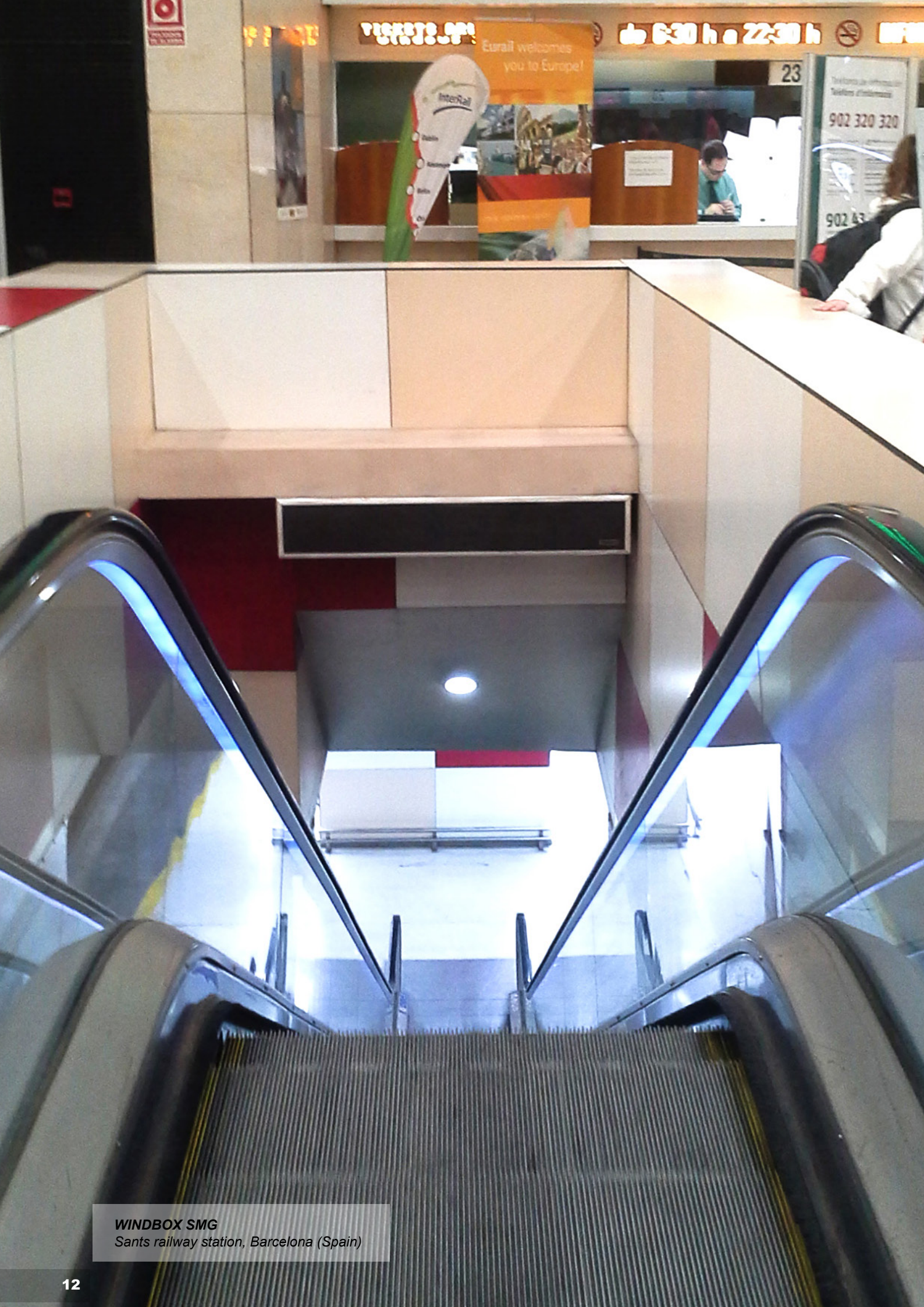
WINDBOX SMG Sants railway station, Barcelona (Spain)