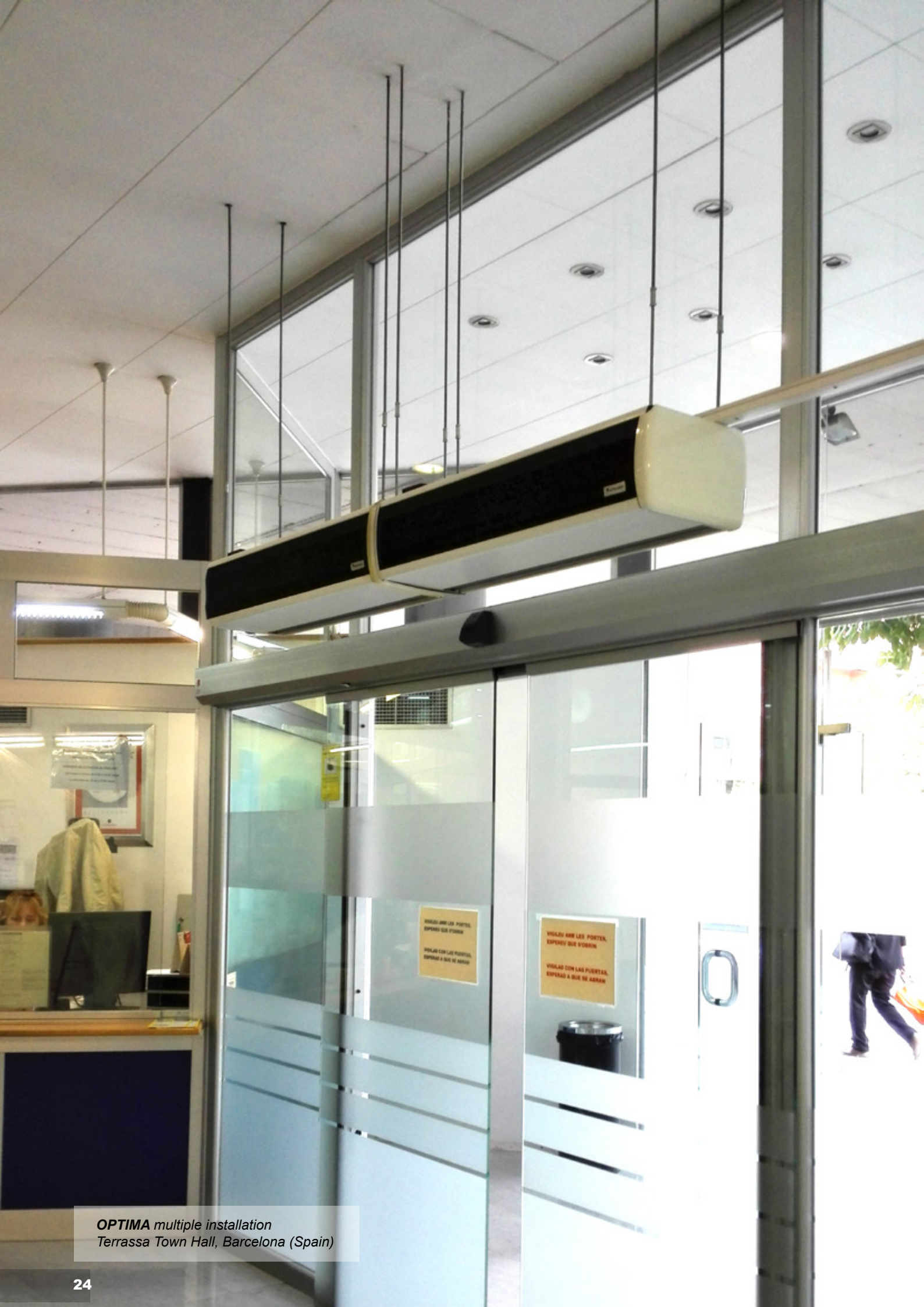
OPTIMA multiple installation Terrassa Town Hall, Barcelona (Spain)