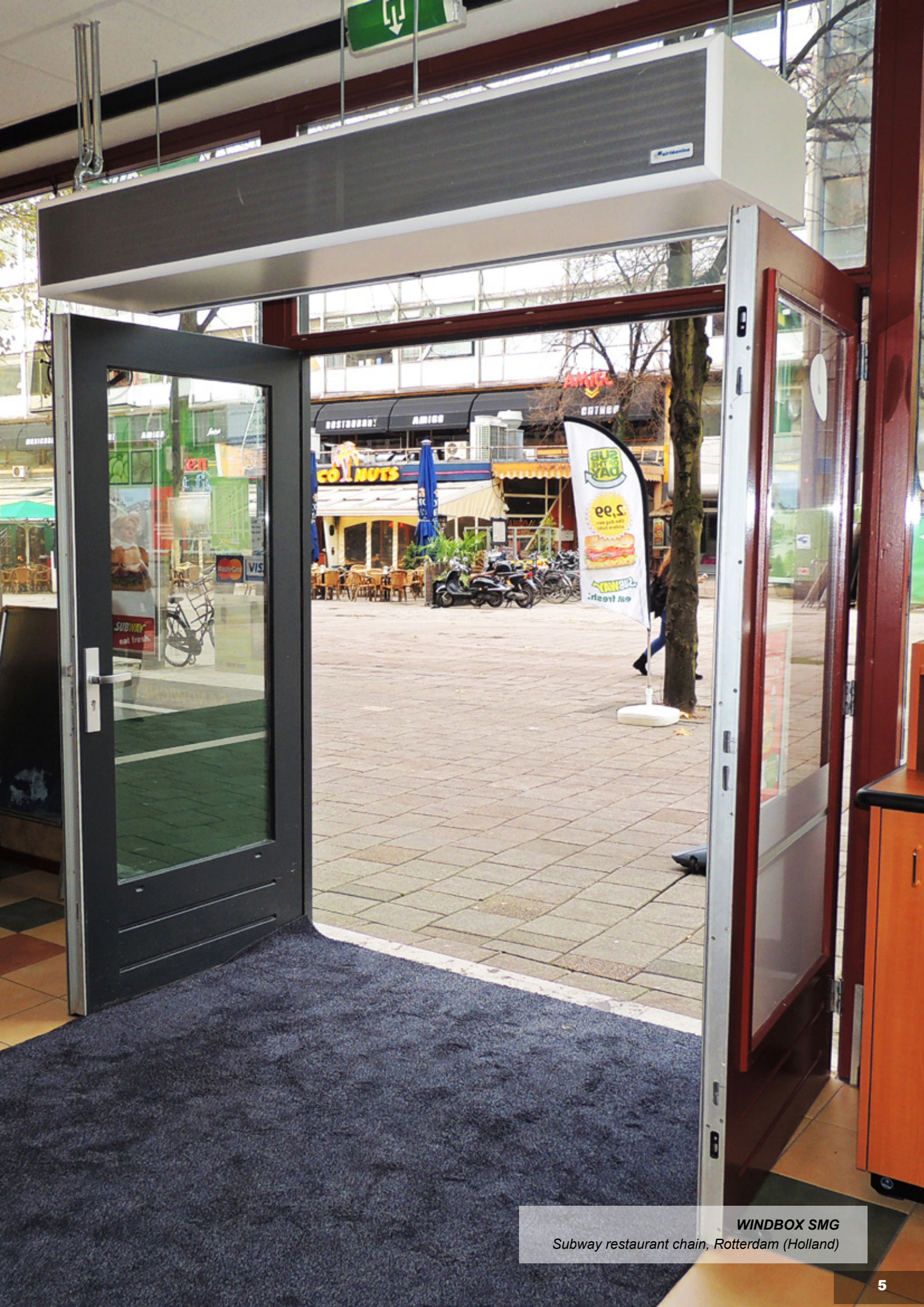
WINDBOX SMG Subway restaurant chain, Rotterdam (Holland)