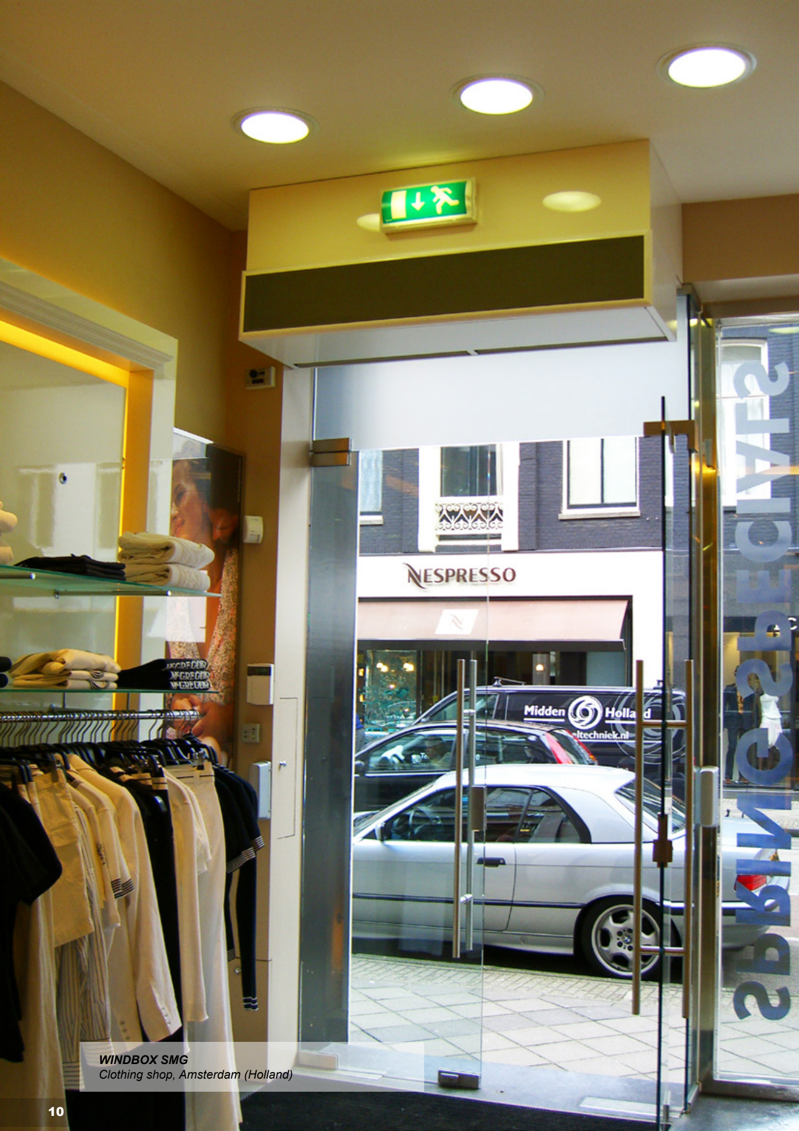
WINDBOX SMG Clothing shop, Amsterdam (Holland)